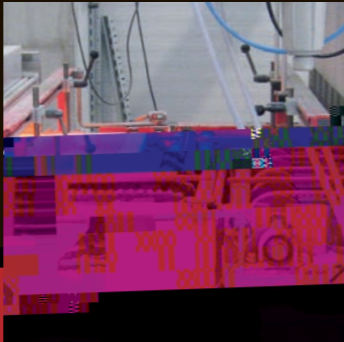
Chain and v-belt conveyor