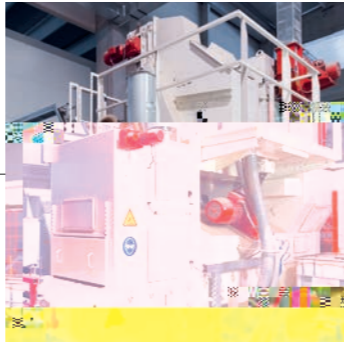
2 Shotblasting machine