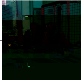
Star-shaped turning device